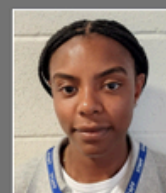
Deputy Designated Safeguarding Lead