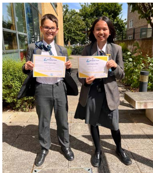
Last year Junior Kangaroo picture