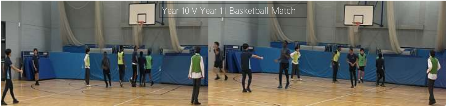
Year 10 V Year 11 Basketball Match

HUGE thanks to our supporters for donating generously and to members of staff for making the week an enormous success. Evelina's children's Hospital send their heartfelt THANK YOU.