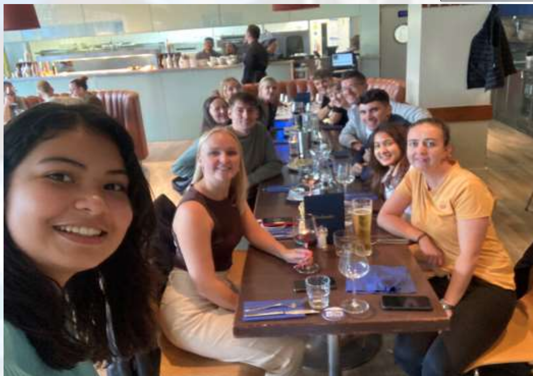
out with the team