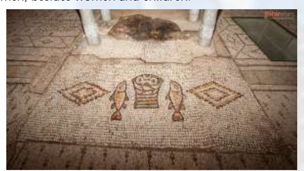
A reflection on this...

"Bring them here to me," he said. And he directed the people to sit down on the grass. Taking the five loaves and the two fish and looking up to heaven, he gave thanks and broke the loaves. Then he gave them to the disciples, and the disciples gave them to the people. They all ate and were satisfied, and the disciples picked up twelve basketfuls of broken pieces that were left over. The number of those who ate was about five thousand men, besides women and children.