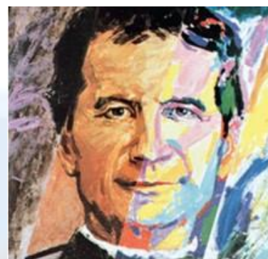
Salesian Values RUAH

Respect the presence of Christ in every person