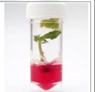
Day 10 - Rooted Tomato plant ready to be grown outside in compost.