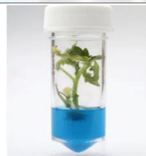
Day 7 - Callus & Root formation has commenced, clearly seen through the gel.