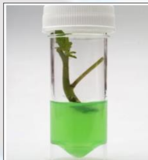
Day 1 - Tomato Cutting taken, surface sterilized and placed in the nutrient rich gel.