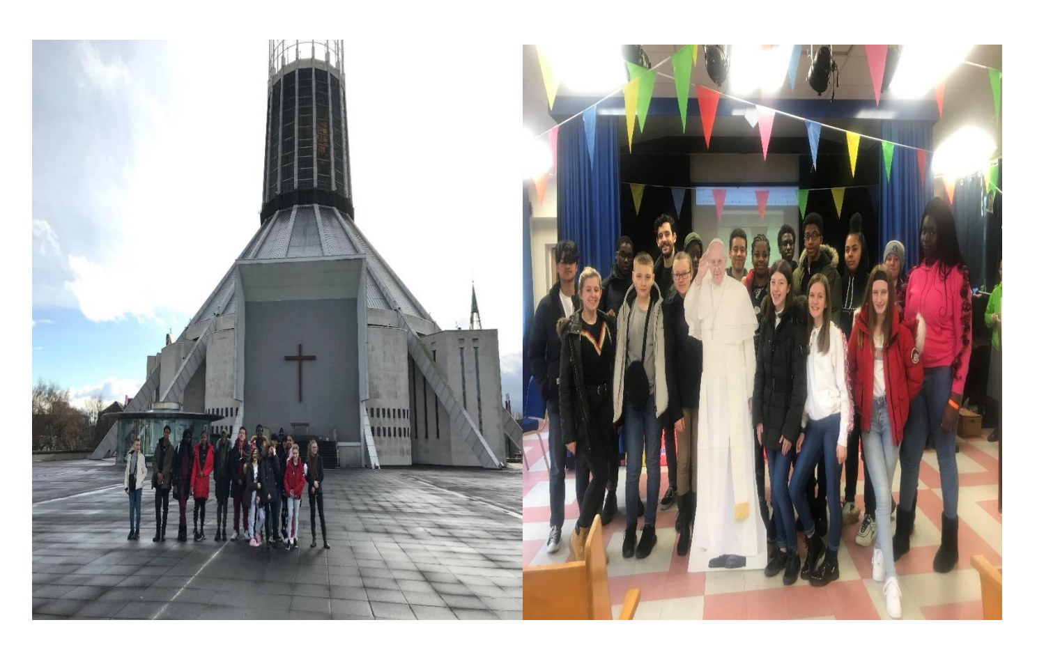
GCSE RE Conference at St John Bosco College Battersea 17th January 2020