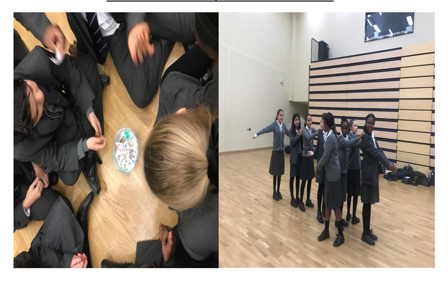
Year 12 Core RE students work on Catholic Social Teaching-December 2019