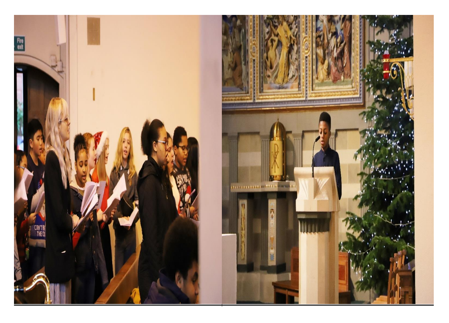
<u>Students were very generous with their donations of non-perishable items for the Christmas hampers-another example of our students putting their faith into action-December 2019</u>