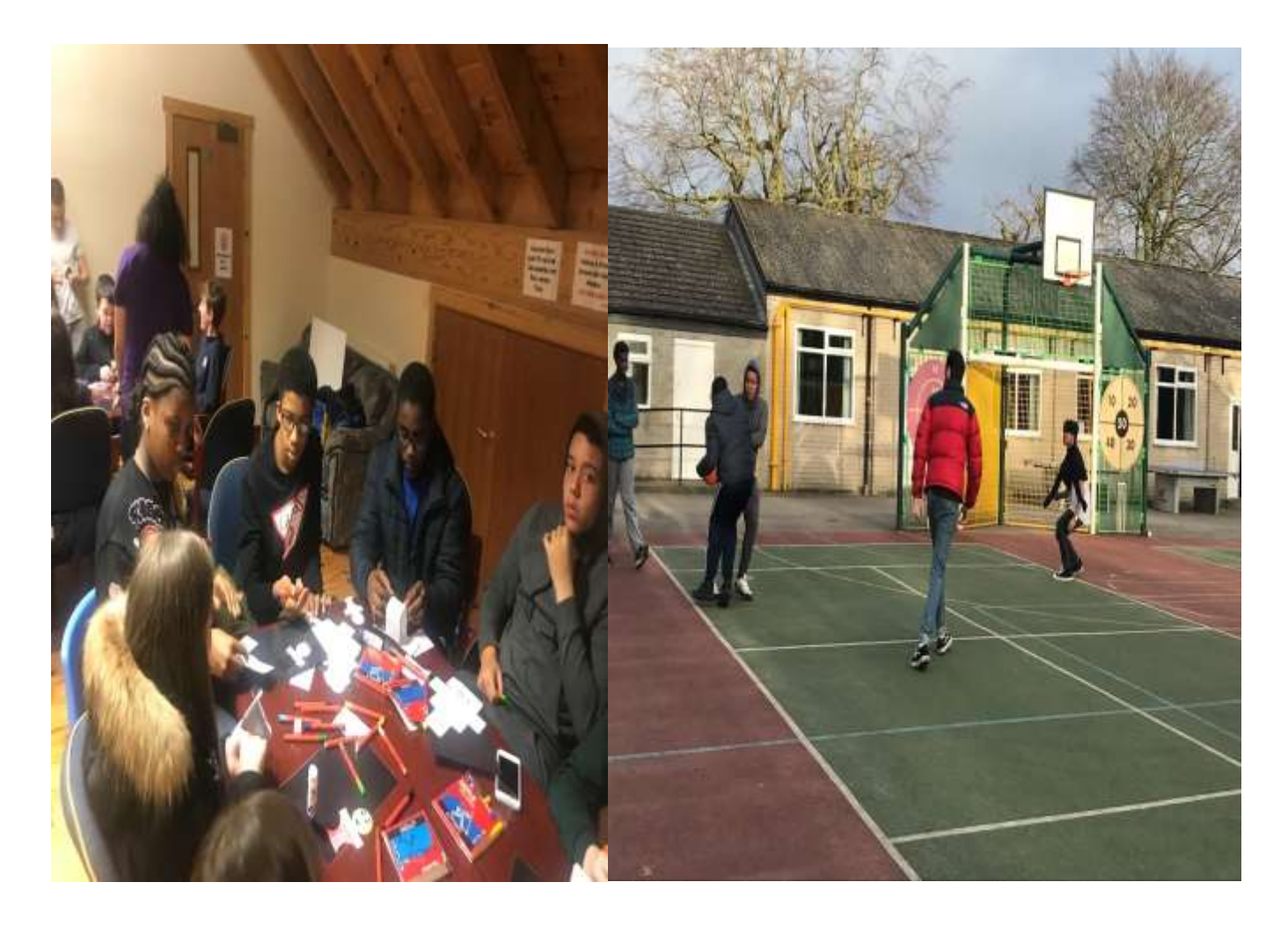
GCSE RE Conference at St John Bosco College Battersea 17<sup>th</sup> January 2020