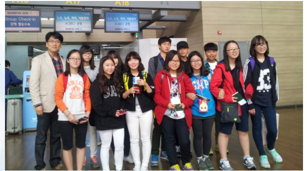
Welcome to the students from South Korea

Looking forward to this term: next week we have a group of South Korean exchange students staying with members of Year 10 for a week and we will be holding a South Korean day across the whole college on Thursday in order to learn about their culture, before our students make their return visit in November. There will be a full report on the exchange in the next Link. As well as this we can look forward to the launch of our Price Waterhouse Cooper's mentoring programme, and for Year 12 the SEO scholars programme which provides them with opportunities to undertake work experience with high profile city firms as well as one to one mentoring from students at Russell Group universities.