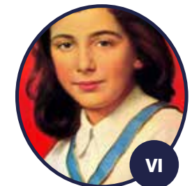
Saint Dominic Savio